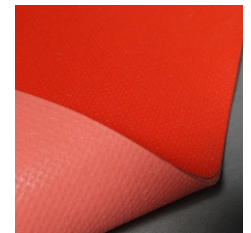
Heat conductive silicone